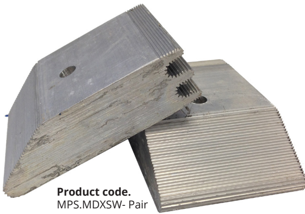
Product code. MPS.MDXSW- Pair