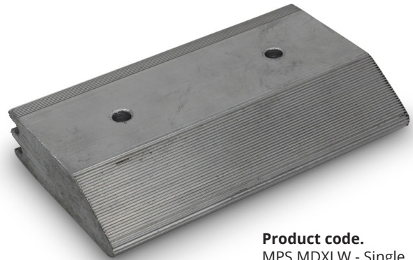
Product code. MPS.MDXLW - Single